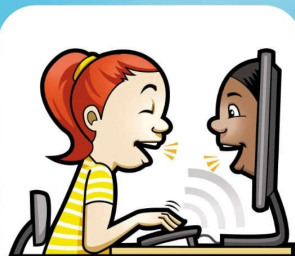
A Parent's Guide to Social Media