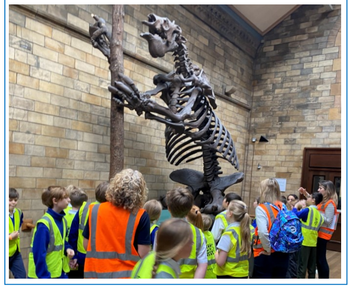
After School Clubs and Wraparound Care

Our club programme is now running for this half of the autumn term, for 5 weeks. There will be no clubs during December, the last two weeks of the term.